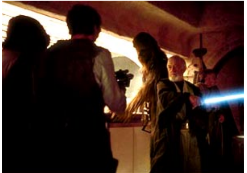
Ben knew how to deal with a bunch of thugs...

After six rounds of combat, port authority officials arrive. All remaining thugs stop shooting and begin complaining loudly that the heroes started everything. If he has not done so already, Arkhee tries to make a break for it.